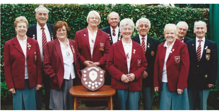
Winners R.A.L. mixed league 2007