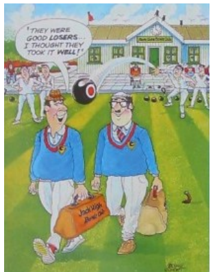
They were good losers, I thought they took it well!