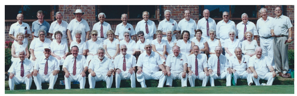
2006 match of St. Chads ladies versus gentlemen